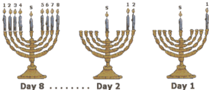
Place right to left; Kindle left to right

Shamai, however, taught that you should light eight candles on the first night of Channuka, and then one candle less each night until there was only one left on the eighth night. Shamai believed that just as the oil diminished from day to day, so too should the light of the candles become smaller each day.